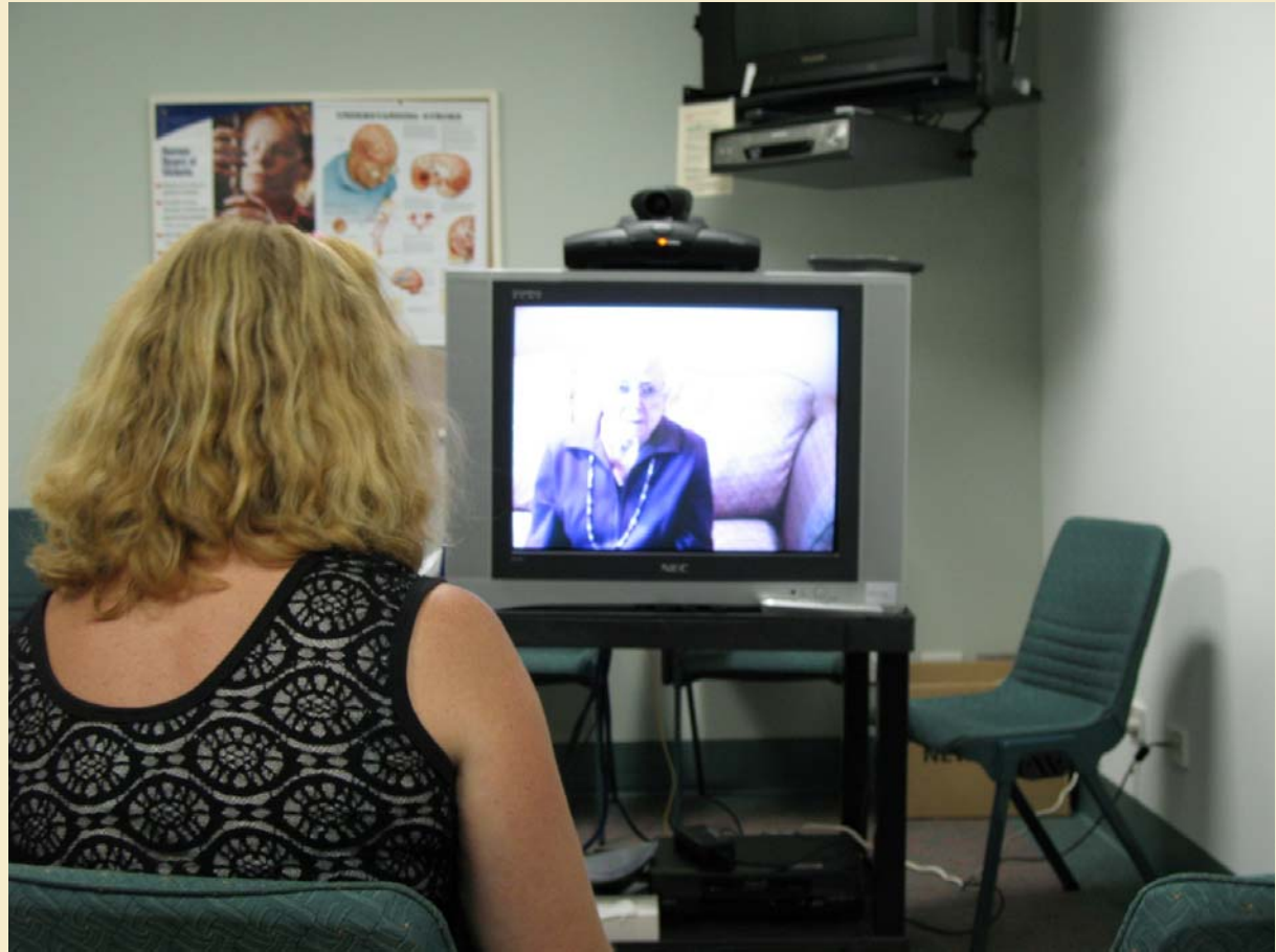
Virtual Visit between Kolor Lodge (Penshurst) and Hamilton Base Hospital

"I found virtual visiting to be a very convenient way to have contact with loved ones and actually see how they are going."